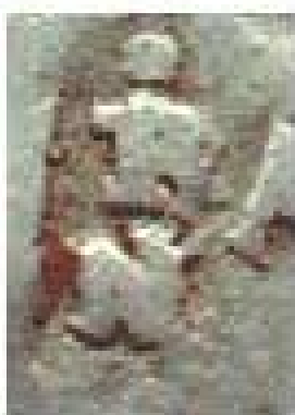
Close up of the RN mintmark beneath the VIII