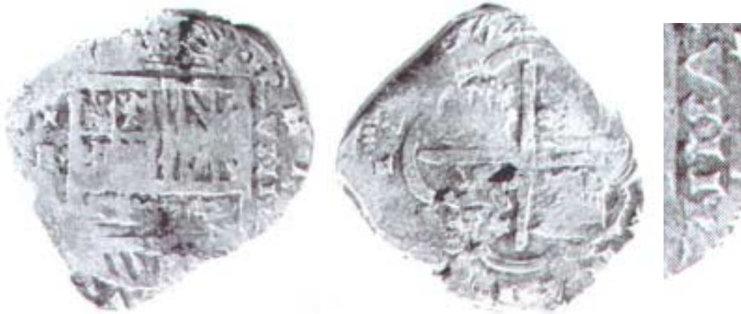
Cayón 5838

My search for other coins of this type produced one other, for a total of three (3) pieces. It is Cayón # 5838 and the photo shows a letter N and part of another letter (R?) immediately below the VIII of the denomination, exactly the same location, but not the same order, as on the two coins illustrated here. The Cayón coin has a partial date of (1)62(X).