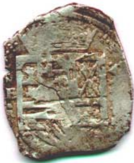
#1818 weight 27.174 grams