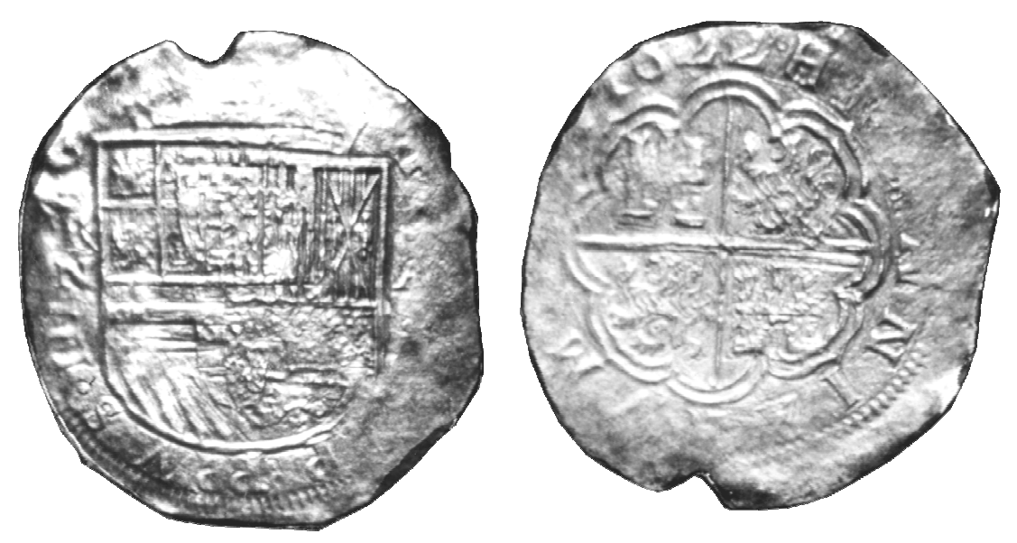
8 Real 1622 M8-1 (R/L 1998) (Actual size approximately 35 mm)