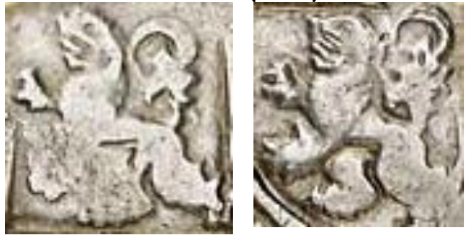
Bushy Tail Lion Castles and Lions used on 8 reales 1665 Aureo & Calicó 242 lot 127 (March 8, 2012).

The closest die comparison of the Hudson specimen to an 8 reales is Stack's-Bowers ANA sale August 18, 2021 lot 40156. Lot description "COLOMBIA. Cob 8 Reales, ND (ca. 1642-51)-NR R. Bogota Mint. Philip IV. NGC VF-35. KM-3.3; Restrepo-M44-21/13; Cal-Type 114. Weight: 25.54 gms. This nicely preserved survivor, struck on a broad flan, exhibits a nearly complete shield and cross with transposed castles and lions. The mint mark is bold and clear on the opposite side of the shield to where it is normally located adding to its collector appeal. Another interesting aspect of this example is that the obverse die appears to be that of Restrepo-M44-21 while the reverse is Restrepo-M44-13. This wholesome looking and attractive example displays lovely light gray tone with areas of richer coloration amongst the devices adding to its eye appeal and desirability." The Stack's-Bowers coin is encapsulated NGC6102729-008 VF35.