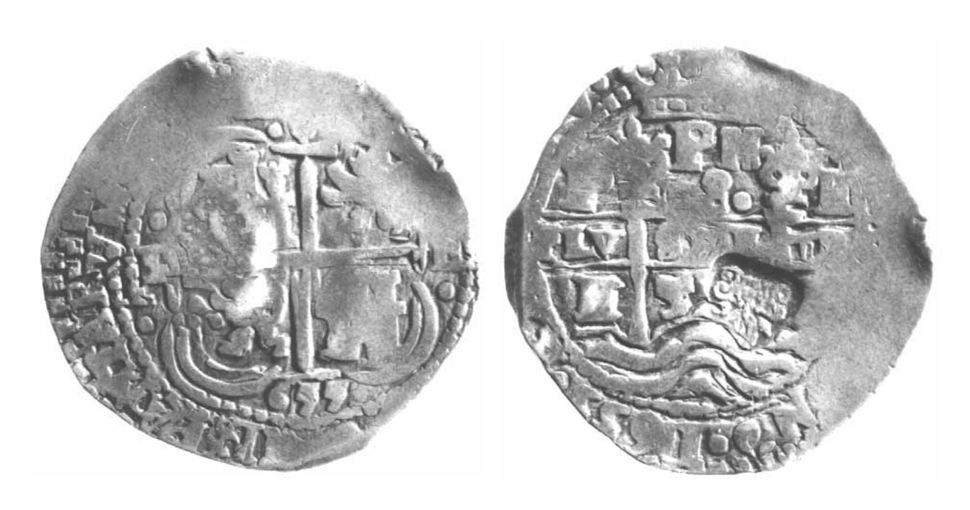
Potosí 8 Reales 1655 assayer E, accession # Geo III Spanish Coin # 1