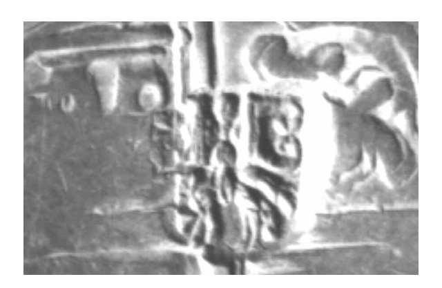
Close up of the counterstamp, rotated 180°

Note the interesting legend on the reverse (right image), the legend reads "HISPANIARVM • REX ET IMDIARVM" The REX (king) should be after Indiarvm, not before it. It translates into English as "Spains King and Indies", when it should read "Spains and Indies King". Note also the backwards N in INDIARVM.