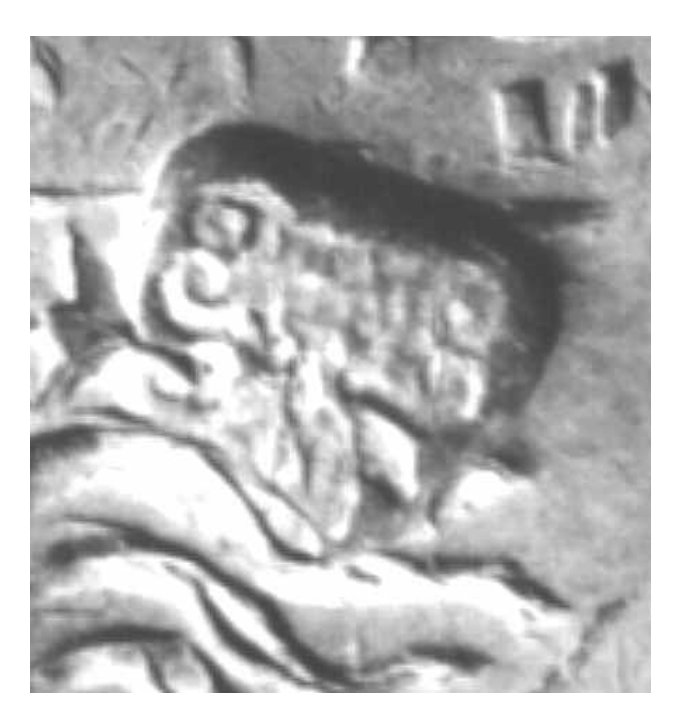
Close up of the counterstamp